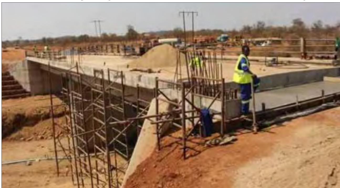
Construction works going on at Ijegan-Ijagemo Road