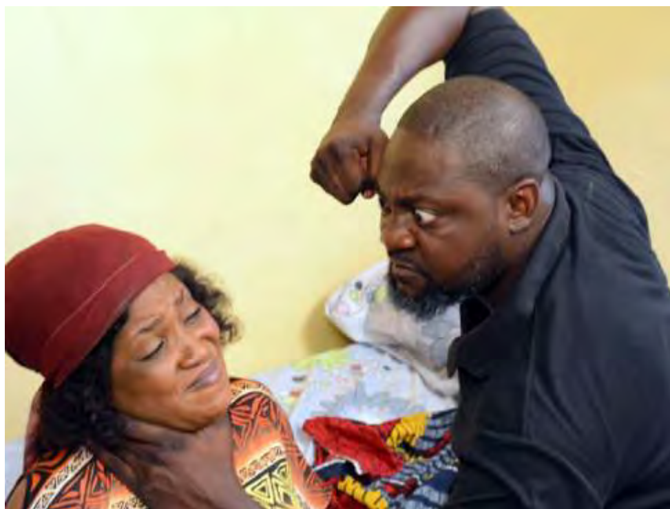
Abusive husband, scene from a movie