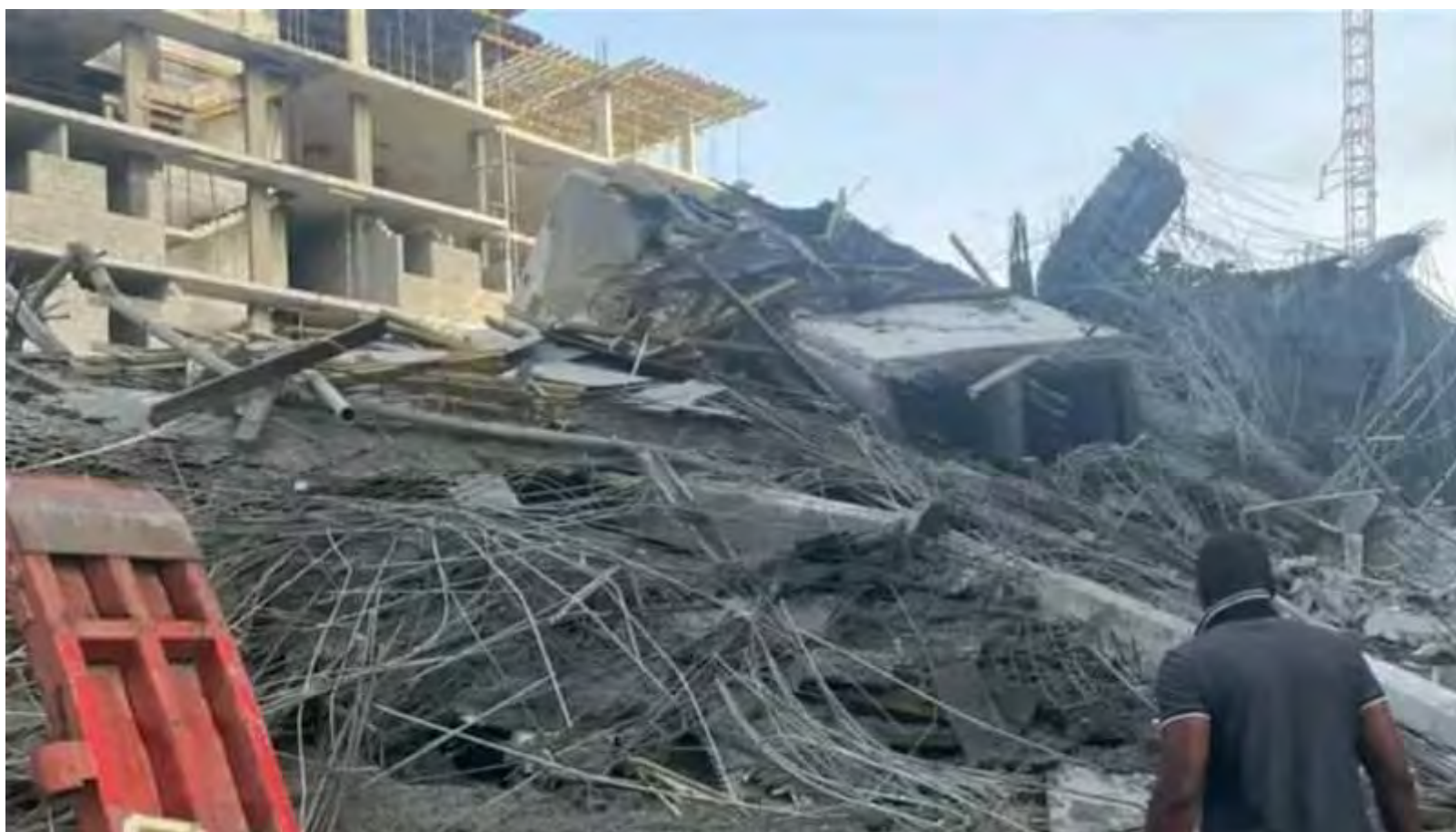
Rubble of the collapsed building at Banana Island