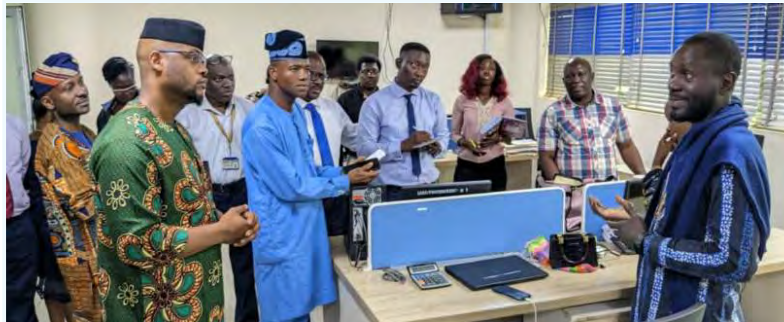
Chairman, Lagos State House of Assembly Committee on Education, Hon. Ajani Owolabi with other members during the visit to LASU