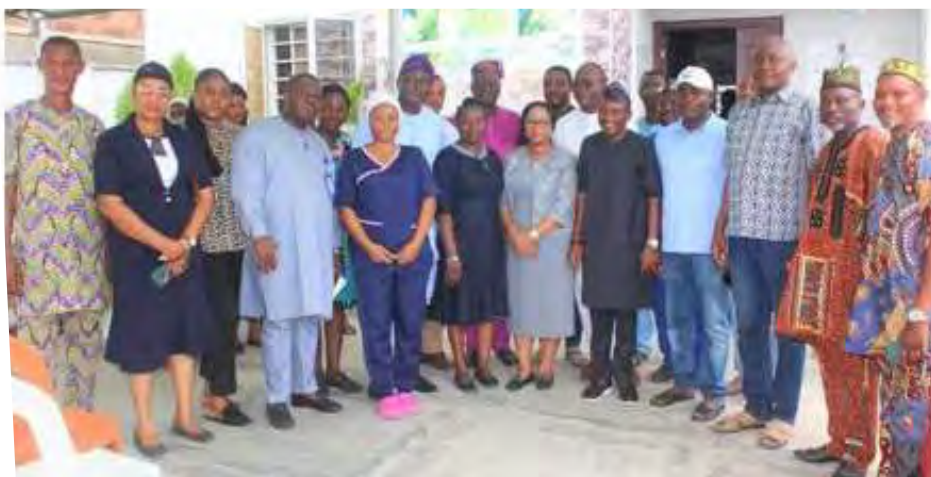
LAHA members during the oversight function visit to Somolu LG