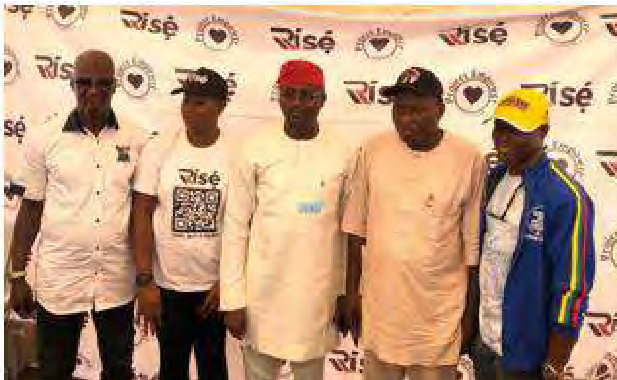
Dignitaries at the event

S urulere Local Government and R í s é . n g empowered 1,000 artisans and vendors in the area by funding their registration on R í s é . n g online business platform to ensure easy access to