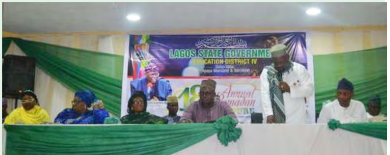
Cross section of dignitaries at Ramdan lecture by Education District IV

patterns and styles within the Civil Service and also hone the communication skills of other staff who are also participants in the training workshop.