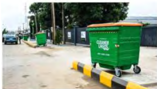
Cleaner Lagos to all communities

It was recorded that Lagos State Government rewarded Local Government areas that distinguished themselves last year in cleanliness.