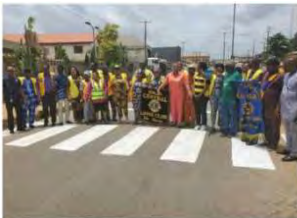
St Patrick's school zebra crossing