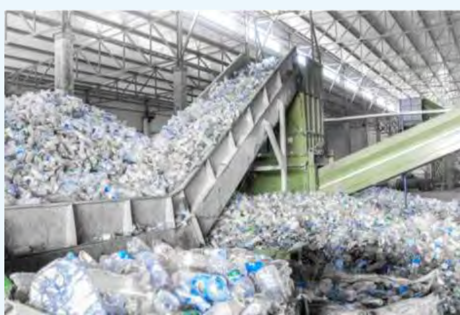
Plastic Waste Recycling Plant