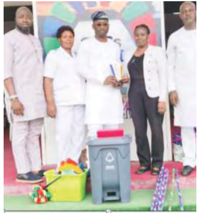
The representatives of Somolu LG receiving the award on behalf of the council