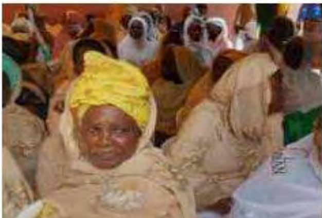
Muslims on Ramadan lecture