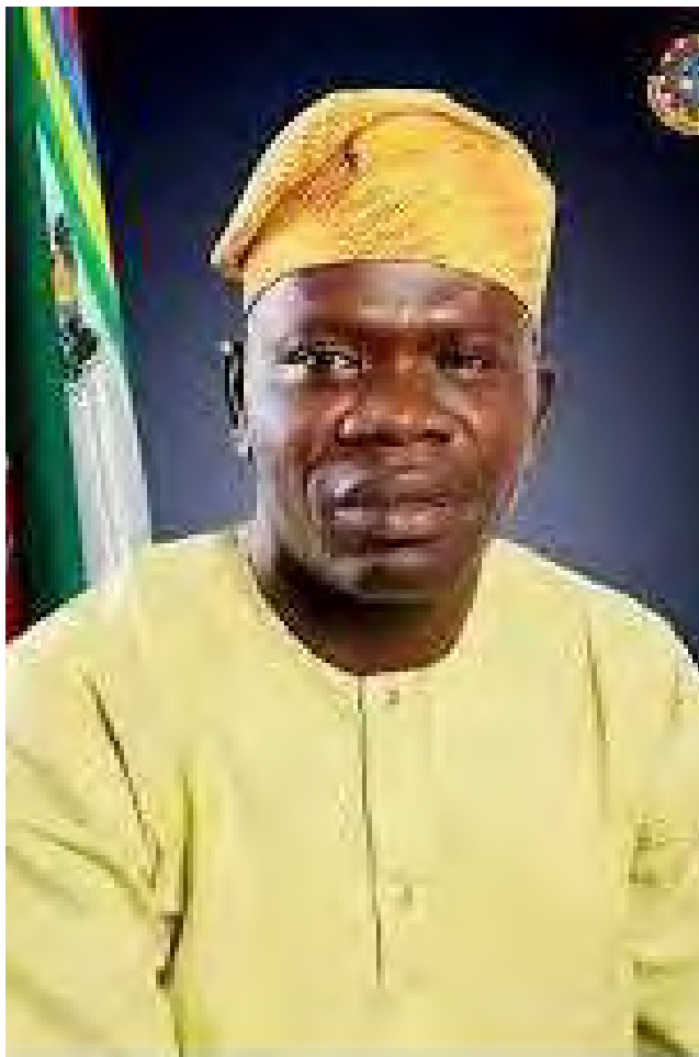
Hon Saheed Adesegun Bankole

Badru expressed his gratitude to the committee for the visit and the support shown