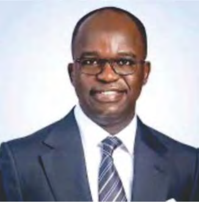
Senator Mukhail Abiru

peaceful coexistence, and leverage our diversity for national development. "I also use this season to implore all Nigerians to continue to pray for our dear nation and also support and cooperate with the incoming administration of Asiwaju Bola Ahmed Tinubu. The enormous task of nation-building requires the support of all well-meaning and patriotic citizens. Therefore, we should collectively join hands to rebuild our nation."