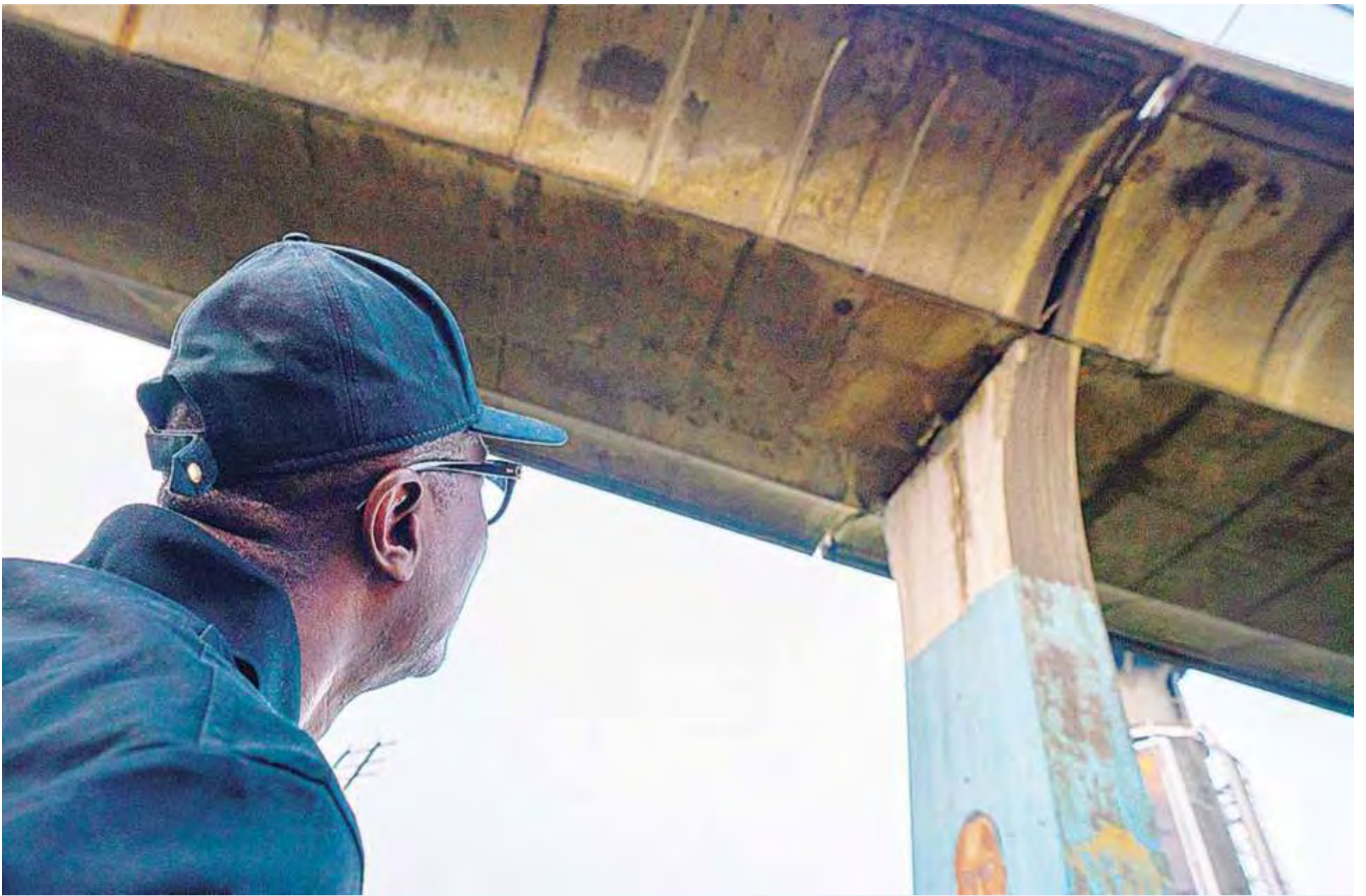
Governor Babajide Sanwo-Olu inspecting the Eko Bridge