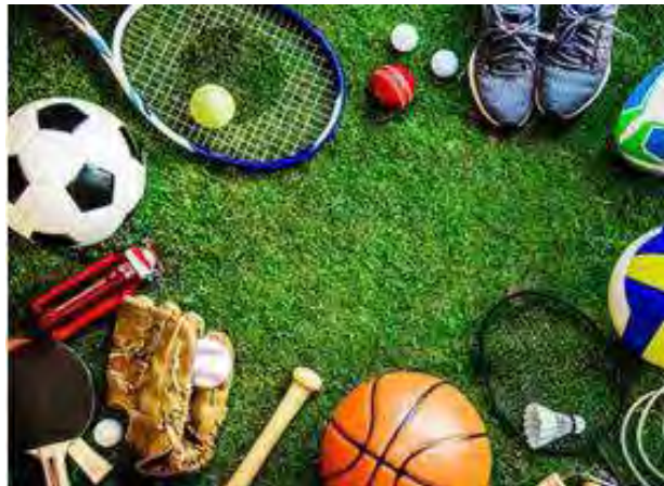
Commonwealth Games for Amuwo Odofin schools

No fewer than 12 schools in Amuwo-Odofin will participate in the Commonwealth Games Nigeria (CGN) planned to organize a Community Grassroots Sports programme for secondary schools in the Amuwo-Odofin Area of Lagos.