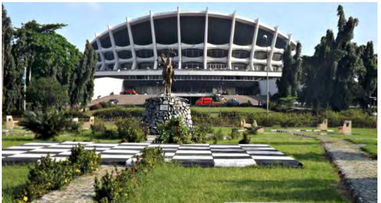
National Theatre Iganmu

exposed to “Effective Speech Writing”, “Effective Report Writing”, “Effective Writing Skills”, “Essentials of Public Service Writing” and “Writing Submissions, Memos”, in addition to several practice sessions and group presentations.