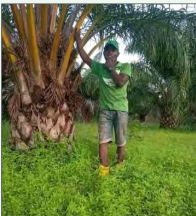
A palm Farmer

The DG further stressed that Lagos State is blessed to have recorded a lot of successes through the Agricultural sector of the